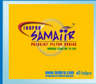
Grain Handling System